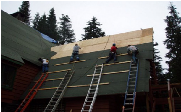
Installing the felt on the entry-way

What can I do ? If you can work off a rope come up and help the Roof Team complete the job. Can't work on the roof? Come up and clean the Cabin, clean the yard, split wood, Dig the foundation for the bridge, help out at the Federation of Western Outdoor Club Convention, sand the benches, paint outside. Heck there are hundred things to do in the height of our Pacific Northwest Summer!